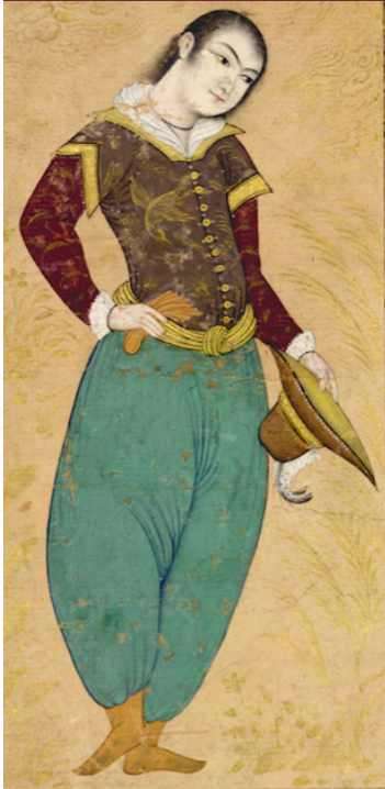
Young man in Portuguese Dress (Iran, mid-17 th Century) - Metropolitan Museum of Art, New York